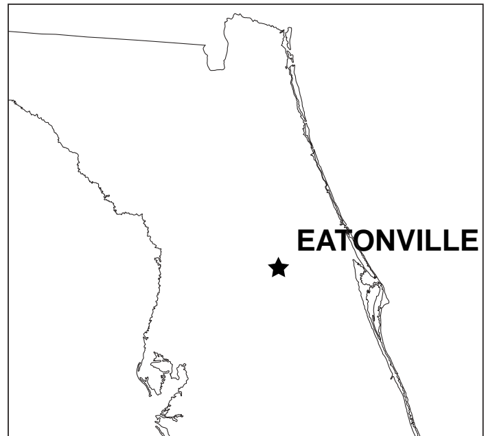
Eatonville is located on the East side of Florida.

Rather than endure the indignities of restriction, some blacks established race colonies, communities of their own. These colonies often