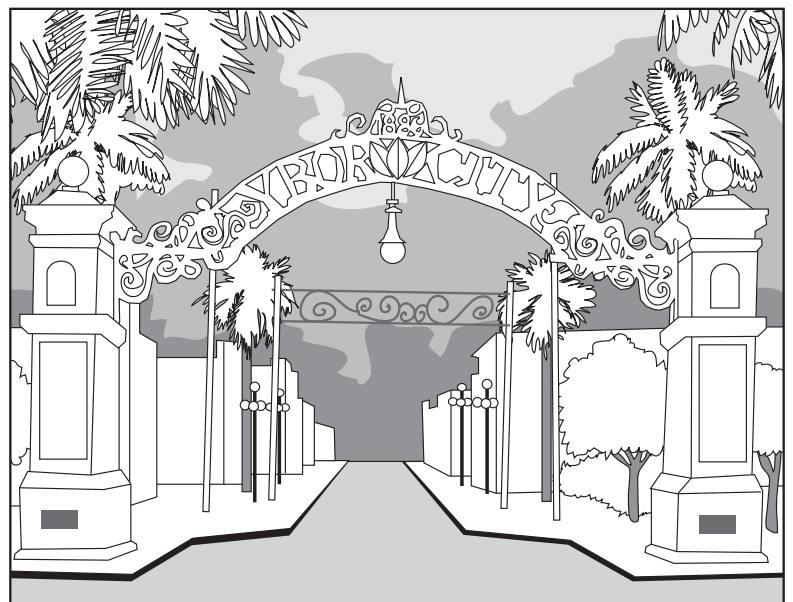
Ornate wrought iron is a distinct feature of Ybor City.

Ybor City is one of three historic Landmark Districts in the state of Florida. The city's past is still very much a part of the present.