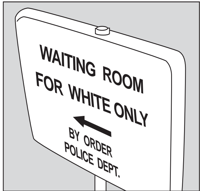
Black Americans were denied access to many public places.

Although it was to take much longer to integrate all Americans economically and fully into society, the official period of reconstruction was over.