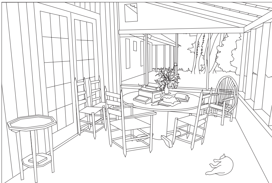
Marjorie Rawlings wrote her popular books on this porch in Cross Creek, Florida.

wildlife, which are abundant. Bok Tower, also called the Singing Tower, is built of marble and coquina shells. It has extensive stonework with massive bronze doors that overlook a long reflecting pool.